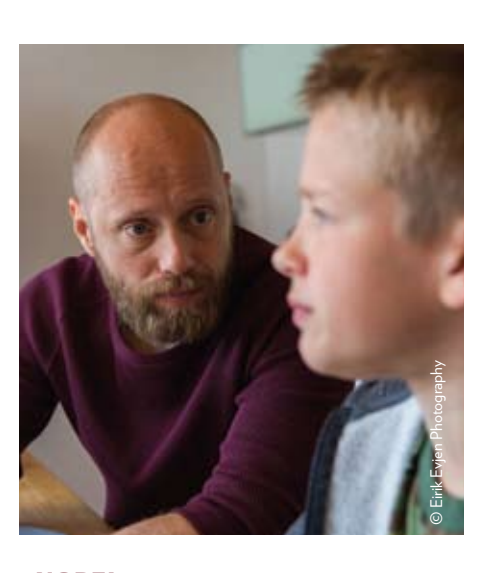
NOBEL (Norway - NRK)