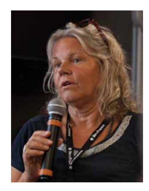
TONE C. RØNNING A VISION OF PUBLIC BROADCASTERS' RESPONSIBILITIES

ALONG THE LINES OF THIS YEAR'S THEMES OF ACCOUNTABILITY AND THE LINKS BETWEEN SERIES AND SOCIETY, SÉRIE SERIES HAS DECIDED TO GIVE THE FLOOR TO GUEST SPEAKERS, FROM VARIOUS BACKGROUNDS, DURING NEW SESSIONS CALLED "ONE VISION". THEY WILL HAVE 15 MINUTES TO GIVE THEIR POINTS OF VIEW AND BELIEFS AND THEIR INTERPRETATION OF THE WORLD TODAY. THEY WILL GIVE PROFESSIONALS IN THE BROAD-CASTING SECTOR A UNIQUE AND INSPIRATIONAL PERSPECTIVE AT A TIME WHEN SERIES ARE BECOMING MORE AND MORE POWERFUL CONVEYORS OF MESSAGES TO THEIR INCREASINGLY "ADDICTED" INTERNATIONAL PUBLIC.